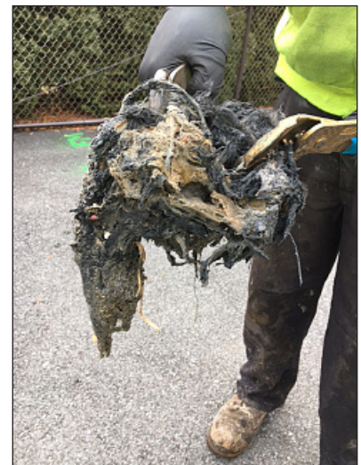
Pictured above: the clogged sewer pump; and a fat berg pulled from the pump.