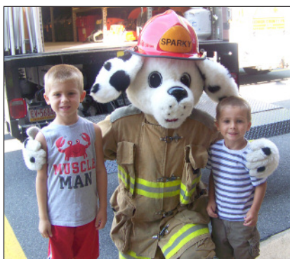
Sparky with friends

Thank you to all who attended our 1st Annual Open House on Saturday, August 17th. The event was a huge success! Our committee worked very hard to make this event a success. Residents and visitors were able to tour the station, see all the equipment, and watch live demonstrations of rescue tools used in motor vehicle accidents. The children were able to squirt a real fire hose to put out a "house fire," and visit the Burn trailer to learn what to do if your house was on fire and much more.