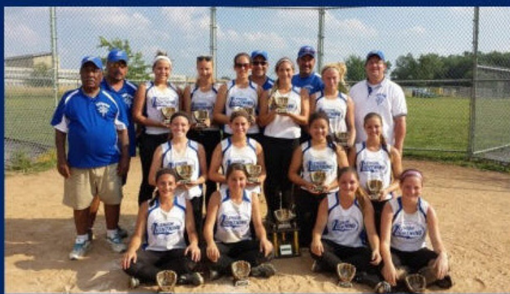
Lehigh Lightning 16U - First Place Champions 2013 USSSA Summer Slide Tournament - Lansdale - 07/07/13

The girls won the gold in their last 3 championships in tournament play, with a 20-game winning streak. It doesn't hurt that 4 of the girls on this team were part of the Lehigh Little League team that won the PA State Championship in 2009, when they were 9 years old. Even though the average age of the girls on this 16U team is 14, they're showing they can compete.