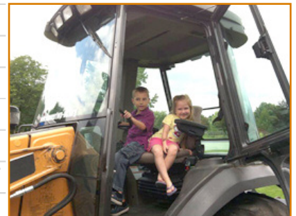
Kids loved the trucks and had the opportunity to vote on their own winners with the Kids Choice Ballots.