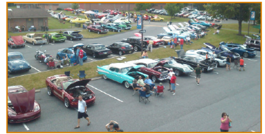
Hanover Township Car Show and Truck Touch was held on Sunday, September 8th.

Thank you to all the folks who brought out their cars or their families to help us honor the emergency personnel in Hanover Township.