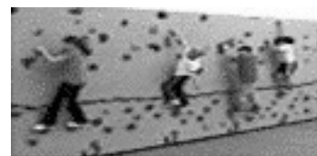
New scaling wall coming this summer!

Can't stop in, call and we will provide you with a PIN. Thank you for taking the time to check it out!