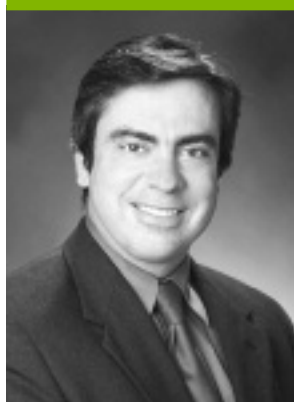
Senator Pat Browne

As a complement to that proposal, I introduced Senate Bill 464 which would enable health care professionals to apply the time they spend providing essential care in a clinic environment toward the continuing education requirements for their specific discipline. The Senate