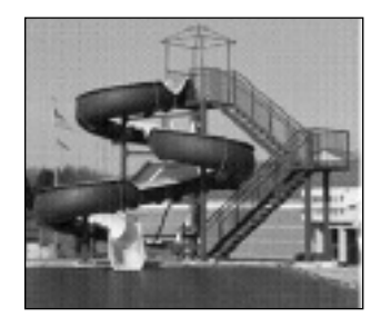
After 5:00 pm - cost for pool pass drops to $2.00 for all ages!

3 month membership is great for the student home from college.