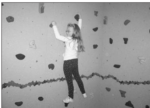
Enrichment children have the opportunity to climb on the scaling wall- great exercise and goal setting curriculum!