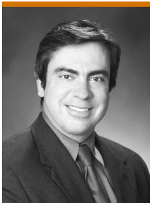
Senator Pat Browne

A COLUMN BY SENATOR PAT BROWNE, 16TH SENATORIAL DISTRICT