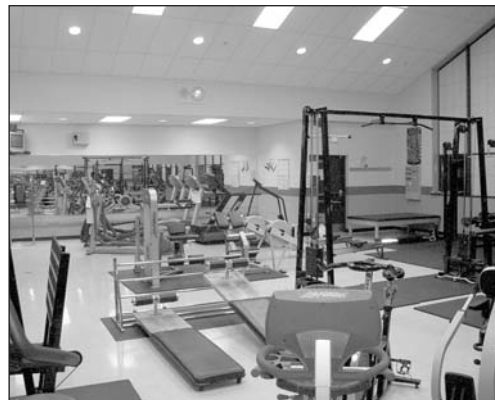
Fitness room available from 6 a.m. to 10 pm- a new interactive bike is coming soon!

Fitness Orientation - Tuesday morning at 10:30 am Q&A with the trainer. Evening by appointment only.